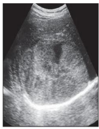
Figure 1. Hepatic US showing big mixed echogenic mass occupying almost whole of the right lobe.

An abdominal CT scan showed an enlarged liver. Multiple space occupying lesions were noted in both lobes, predominantly in the right lobe (the largest one was about 14.7x10.9 cm) consisting both cystic and fatty components showing low density area on plain study but peripheral rim enhancement was noted on early phase and washed out on delayed phase. Final impression of CT scan was suggestive of multi-focal Hepato Cellular Carcinoma (HCC). But other possibilities like secondary deposits, sarcomas also could not be ruled out.