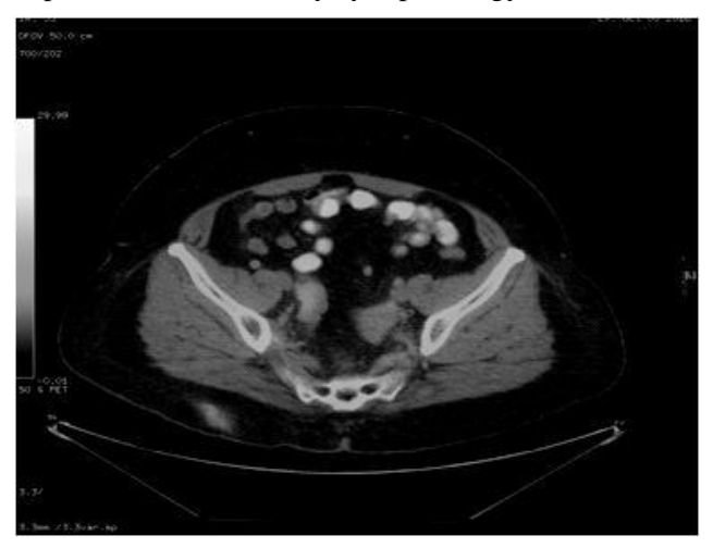
Figure 2: An axial view of PET-CT scan shows FDG avid (SUV max 3.4) metastatic deposit in cutaneous layer at right buttok in a known case of ductal carcinoma of right breast.

9.0 X 8.0 mm size at 5 mm depth from skin surface was identified in high resolution 2D ultrasonography. Fine needle aspiration cytology from the swelling was showed done and metastatic adenocarcinoma. morphologically consistent with ductal carcinoma breast. She was subjected to whole body 18 FFDG PET-CT scan to restage the disease at a private PET centre, Dhaka. No abnormal FDG uptake was noted over the right chest wall and both axillae. Mild FDG uptake (SUV max 3.8) is noted in the swelling (1.5 cm X 1.2 cm) in the cutaneous layer at right buttok (Figure 2). Finally the swelling was removed and metastatic deposit was confirmed by cyto-pathology.