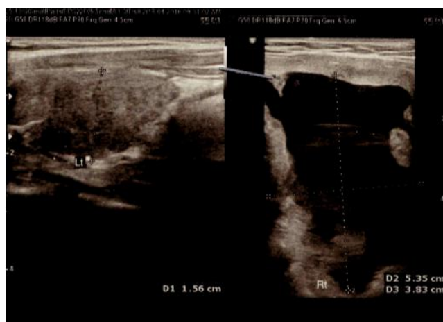
Figure 1. Ultrasound imaging of Neck region.

and difficulty in movement for one year. On clinical examination, a mass was palpable in the region of thyroid gland Serum biochemistry was showing features of severe hyperparathyroidism [Parathormone 2183.1pg/ml (range 10-65pg/ml); Calcium 12.9 mg/dl (range 8.5-10.2 mg/dl)]. Serum creatinine (0.88 mg/dl) was however normal. Thyroid function tests also indicated normal status (FT4- 8.88 pmol/L, TSH- 3.08 mIU/L). Ultrasonogram (USG) neck revealed 5.3 × 3.8 cm U3 nodules with both solid and cystic components in right thyroid bed which was more likely to be thyroid origin rather than parathyroid origin (Figure 1). X-ray of right hip joint showed fracture at the neck of right femur. X-ray Mandible showed multiple lytic lesions in the body of the mandible. Contrast enhanced CT scan of neck was suggestive of malignant thyroid mass having mediastinal extension with expansible lytic lesions noted at body of the mandible, right sided angle of mandible and anterior aspect of maxilla (Figure.2).