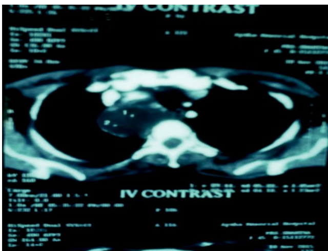
Figure 2. CT scan of Neck

FNAC revealed malignant lesion of thyroid origin. As severe hyperparathyroidism could not be explained by CT and FNAC findings of possible thyroid origin, Tc-99m MIBI parathyroid scintigraphy was then performed to evaluate the parathyroid gland. A single tracer dual phase SPECT was done with intravenous injection of 20 mCi of Tc-99m MIBI. Early phase images showed diffuse area of increased tracer uptake in the anterior neck with central large photon deficient area (corresponding to the palpable mass previously identified as cystic in nature by USG) (Figure 3). Delayed (post 2 hour) phase images showed significant washout of tracer (Figure 4) which was more in favor of thyroid origin of the mass rather than parathyroid. Finally, the patient underwent surgery and histopathology report confirmed parathyroid carcinoma.