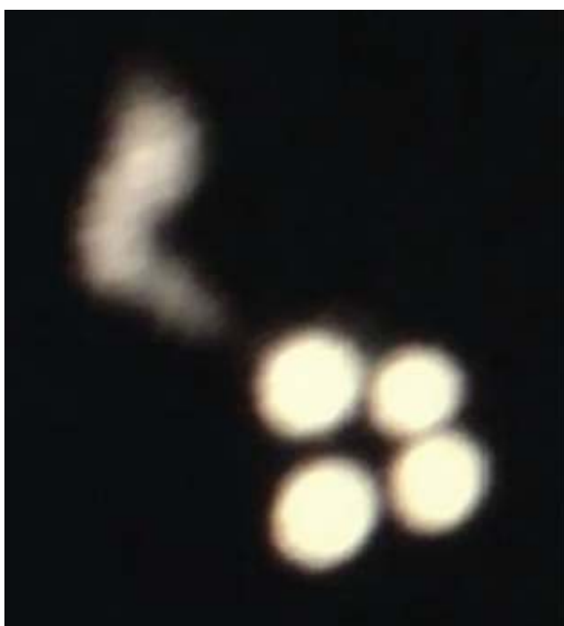
Figure 2: Immediately after injections at four sites around the nipple showed early lymphatic drainage towards axilla.

Dynamic sequential 10 sec images were obtained in anterior and lateral projections for 5 minutes immediately after injections. Then images were taken every 5 minutes for 1 minute till 45 minutes (Figure 3).