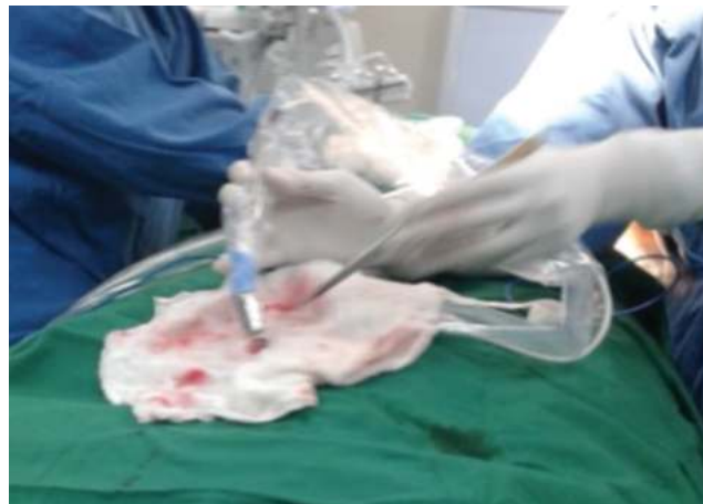
Figure 6: Confirmation of SLN in excised sample by Gamma Probe