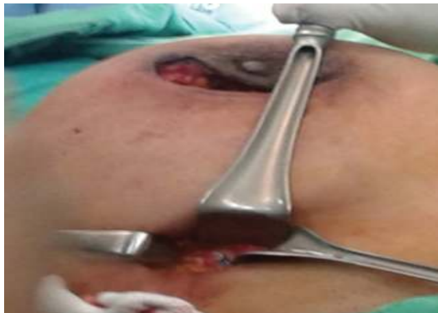
Figure 5: Surgical exploration and extraction of SLN from axilla