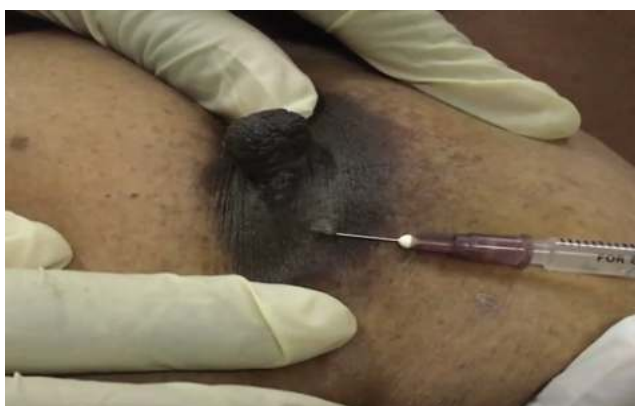
Figure 1: Intradermal injection with bleb formation in site I

In this study, 0.5 - 0.8mCi (20-30MBq) of nanocolloid was taken in a 1-ml syringe and was injected intradermally (Figure 1) in areola of the affected breast in approximately equal four divided doses in four quadrants of breast (Figure 2).