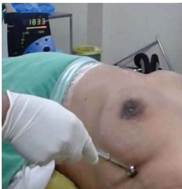
Figure 4: Confirmation of SLN with Gamma Probe before surface marking; high count rate is seen in the machine display.

If SLN was not visualized, delayed imaging was done after 2 hours. Radioactive marker was used to correspond with the SLN activity and location was marked on the skin. Gamma probe was used to reconfirm the SLN (Figure 4). Surgical resection of SLN was done (Figure 5, 6) followed by frozen section biopsy.