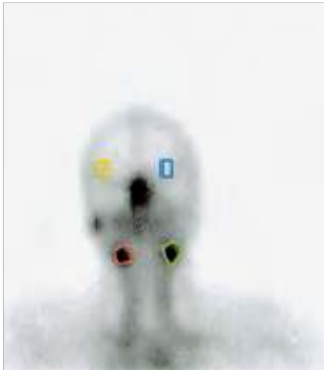
Figure-2a: Dynamic Sialoscintigraphy of both submandibular salivary glands.