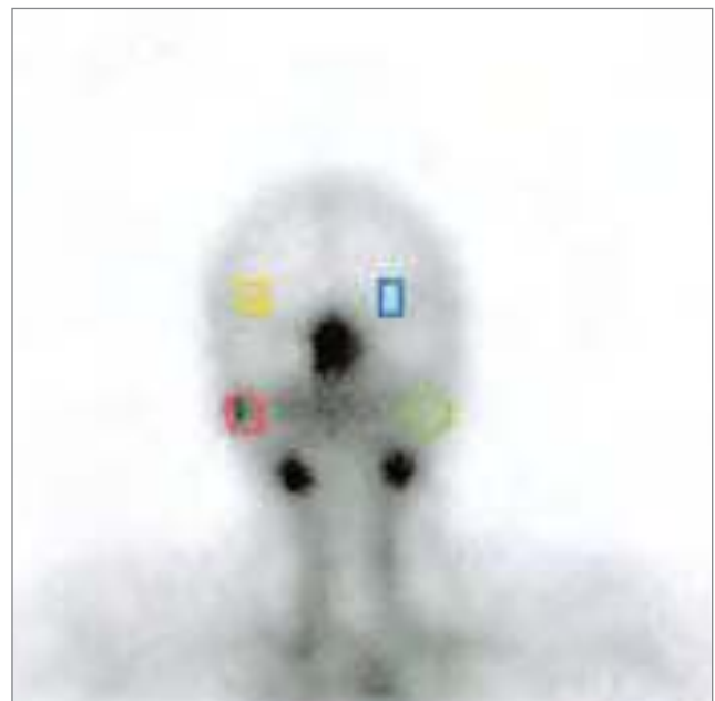
Figure -1a. Salivary Gland (Parotid) dynamic sialoscintigraphy

The study was conducted after the radioiodine therapy of about 1.8-2.3 years. This study showed that increase of right parotid gland, among 06 male patients 50% and 53.3% had decreased salivary function. About 50% male and 55.6% female had decreased left parotid gland salivary gland dysfunction. About 33.3% male and 11.1% patient had right submandibular salivary gland dysfunction. This study also showed that 16.7% male patients and 6.7% had female patients had left submandibular dysfunction.