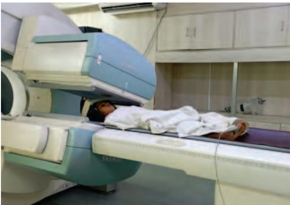
Figure 2: A 3-year-old boy undergoing 99m Tc-ECD Brain SPECT with dual head gamma camera.