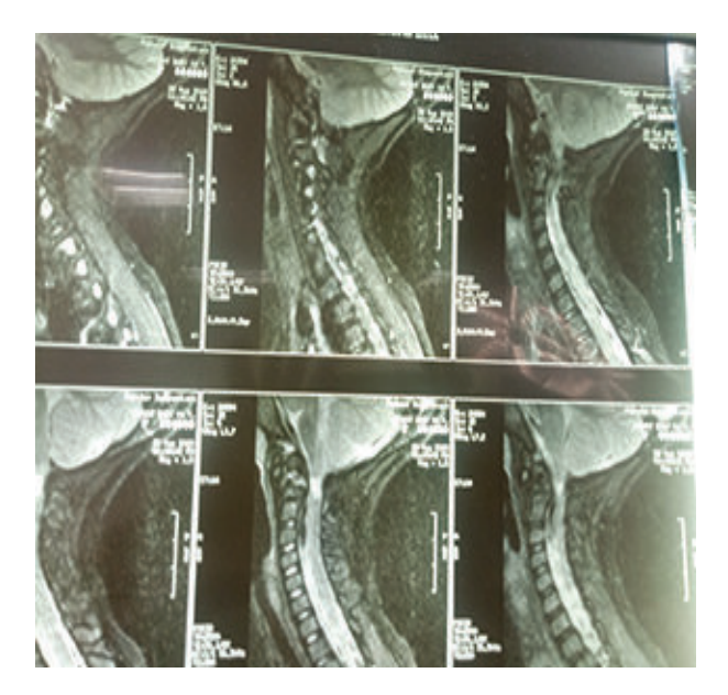
Fig.-1: MRI of cervical spine showed atlantoaxial dislocation with cord compression

Table shows 10% of patients had wound infection and 3.33% of patients had screw and plate dislocation.