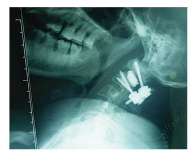
Fig.-10: Postoperative x-ray after fixation