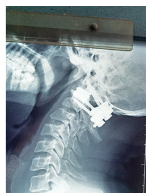
Fig.-5: Postoperative after fixation