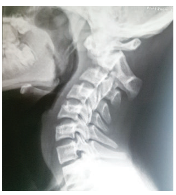
Fig.-11: Pre-operative x-ray with atlantoaxial dislocation