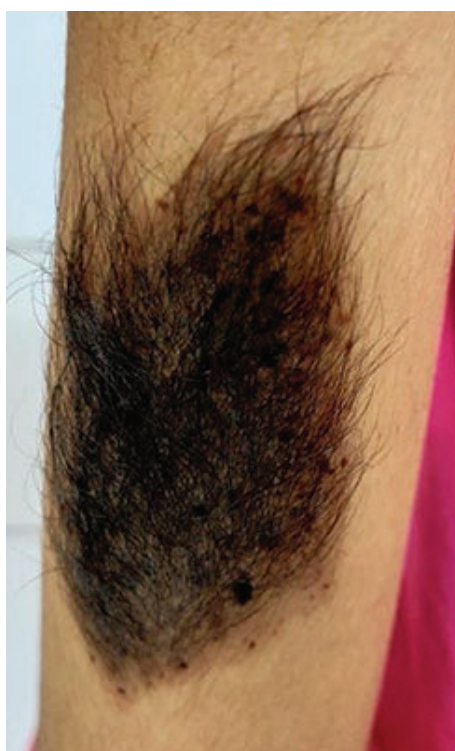
Fig.-2: Hairy melanocytic Naevus

enhanced sinus tract at the level of 5 th & 6 th dorsal vertebra (D5 & D6) with spinal cord bifurcation against the same level (Figure 3). Sinugram with fluoroscopy and spot radiography revealed small sinus tract in the back of upper dorsal region 4 th & 5 th dorsal vertebra (D4 & D6) which was opacified and there was no fistulous communication (Figure 4).