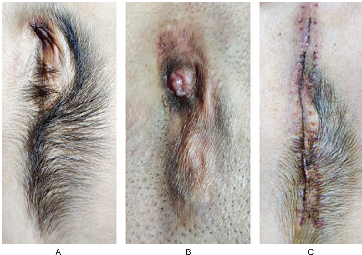
Fig.-1: Dermal sinus with hypertrichosis (A. & B. Pre-operative C. Post-operative)