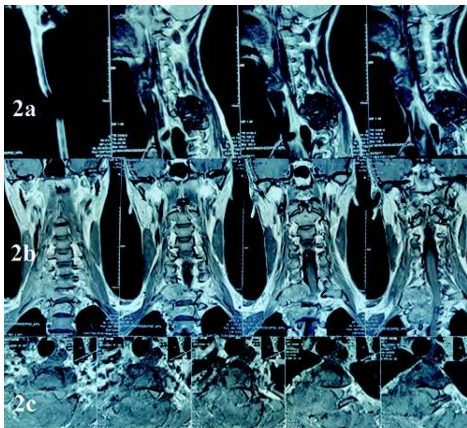
Fig.-2: Pre-operative MRI 2a. Multiple sagittal sections with MR myelogram showing extent of vertebral involvement and dural tube compression, 2b. Post-contrast Coronal sections showing heterogeneous contrast uptake and involvement of vertebra is more on the right side and cord is pushed towards left, 2c. Post-contrast axial sections showing spinal canal stenosis and cord is compressed and pushed anteriorly and to the left.