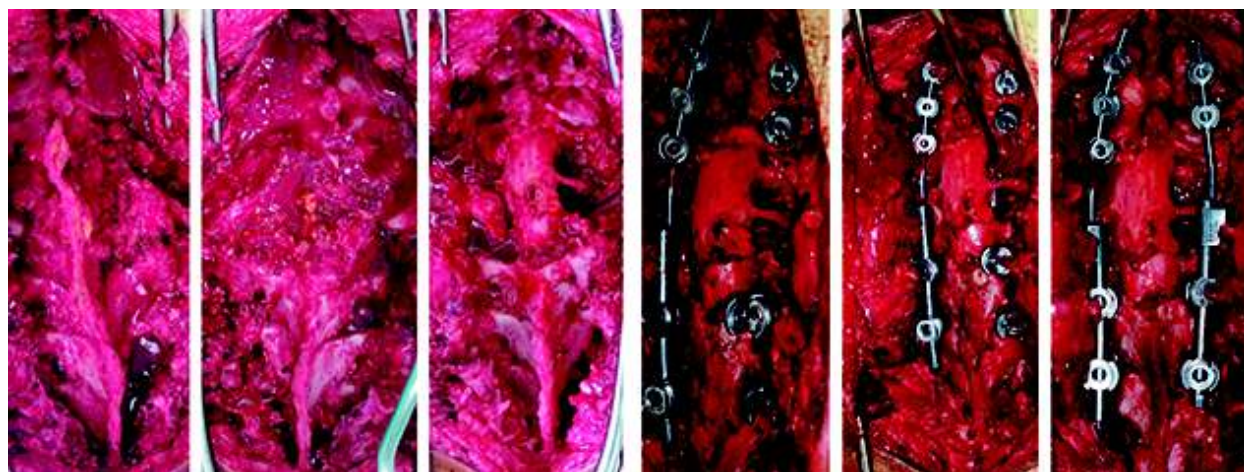
Fig.-4: pictures at various stages of the operation, 4a. Just after exposure of the lesion, 4b. After partial debulking yellowish blood degradation products can be appreciated, 4c. After decompression of neuronal structures 4d. Screws and left rods with domino connector can be seen here 4e. Self-expandable titanium mesh cage has been inserted in-between right C7 and D1 nerve roots 4f. Also right rods with domino connector has been implanted.

correction of cervico-dorsal subluxation and implant position with C-arm. Then cervico-dorsal fixation on the right side was done with rods connected by domino connector. After ensuring proper hemostasis wound was closed in layers with a drain tube in situ.