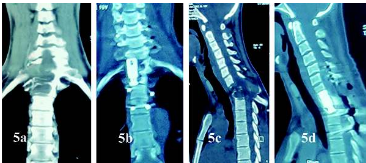
Fig.-5: 5a-preoperative and 5b-postoperative coronal reconstruction of CT scan; 5c-preoperative and 5d-postoperative sagittal reconstructions of CT scan. In sagittal reconstruction, correction of cervico-dorsal subluxation can be appreciated.

Neck pain subsided, spasticity resolved & muscle power improved with no residual neurological deficit. Post-operative radiological images (Figure-5) shows correction of cervico-dorsal dislocation and confirms well position of all implants. But unfortunately histopathology from multiple centers could not give any definitive diagnosis.