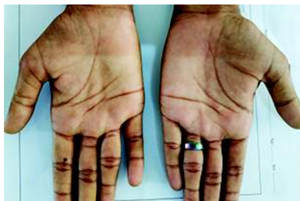
Fig.-1: Gross wasting of right thenar and hypothenar muscles

General other systemic examination findings were unremarkable.