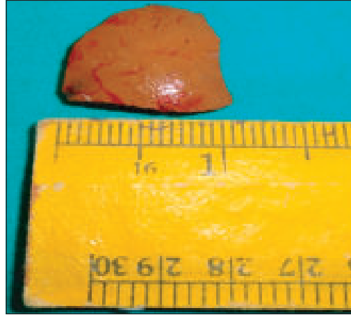
Figure 3: The terracotta foreign body 2.5x2cm after removal.

terracotta pot of the fireworks. Post operative recovery was uneventful.