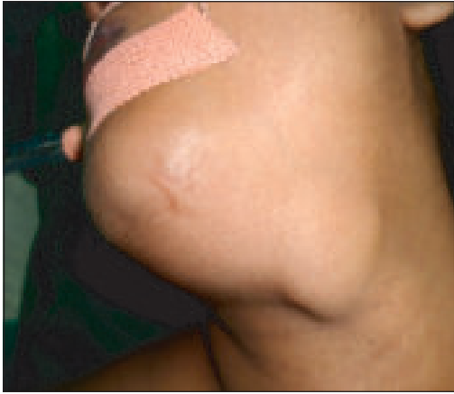
Figure 1: Clinical photograph of the patient.

On careful questioning she said this scar was of an accident two years back when a big flowerpot (a type of fireworks) exploded while she was lighting it during Diwali festival (Kali-Puja). The wound was stitched up in the local hospital. No relevant papers on investigation and treatment, pertaining to the accident was available. CT scan revealed a solid wedge shaped object close to the airway and anterior to the neuro-vascular sheath (Figure 2).