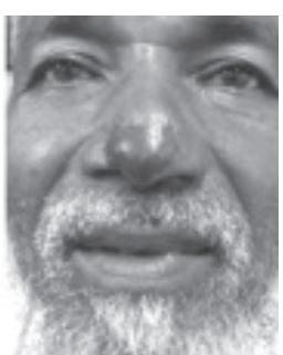
Fig-9, 10 : Post-operative after 6 & 12 months. Fig-7, 8: Post-operative after 14 days & 21 days.