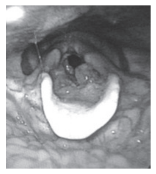
Figure 1: 70 degree scope image showed multiple papillomatous mass at supralaglottic region arised from arytenoid and aryepiglottic fold obstructing laryngeal inlet

Primary Laryngeal Tuberculosis Masquerading Laryngeal Malignancy Nik Mohd Syukra Nik Abdul Ghani et al