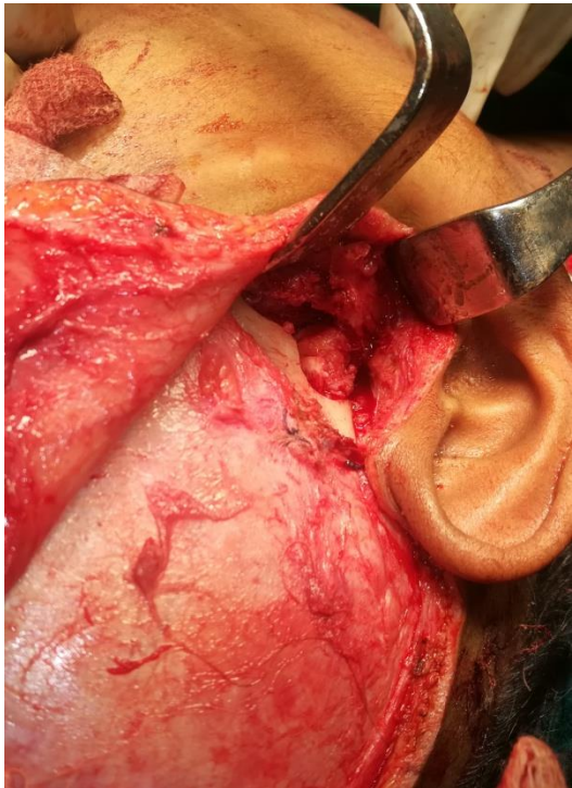
Fig. 2: Sternoclavicular joint was replaced in the gap