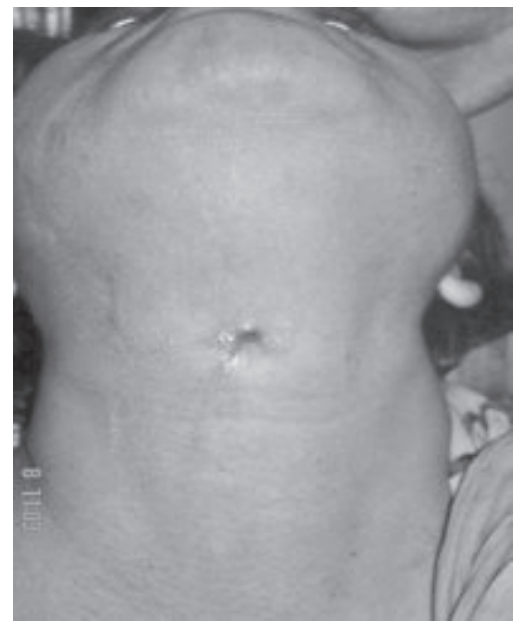
Fig.-1 : Discharging opening in the anterior neck located at the level of the thyrohyoid region.

A 55-year-old female presented with a discharging opening on the front of her neck for the past 5 years. The discharge increased with swallowing and tongue protrusion. She had a history of swelling in the same region 30 years ago, which became infected and