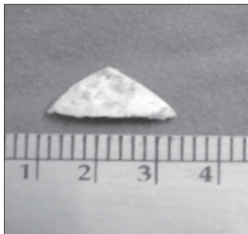
Figure 2: The triangular shaped porcelain piece after removal.

to prevent aspiration. A pediatric nasendoscope was used for direct visual inspection of the nasopharynx. A triangular piece of porcelain was seen lodged in the postnasal space with its two edges almost impinging on the two tubal openings. It was covered by granulation tissue and there was significant bleeding on attempts at removal. However the space was too narrow for the purpose of removal of the foreign body itself via the nasal route. With digital examination, the foreign body was felt grossly impacted in the edematous nasopharyngeal mucosa, including the adenoids. Two narrow and soft rubber catheters were passed through the nasal cavity and taken out from the mouth with a gentle upward traction, thereby lifting the soft palate. The foreign body was finally dislodged with digital manipulations but only after several attempts, as granulation tissue covered the material entirely and manipulations in a very small space, further reduced by edema, resulted in bleeding. Suction of the oral cavity and oropharynx was done whenever required. After dislodging, it was taken out with Negus' forceps through the mouth. The porcelain piece measured approximately 2.1 cm x 2 cm x 1.8 cm [Figure 2]. Hemostasis was ensured.