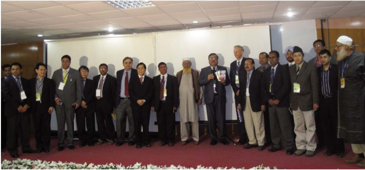
BOS Executives with International delegates