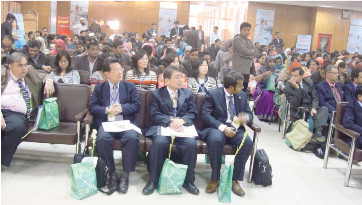
Partial view of Scientific Session