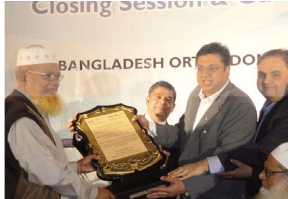
Plaque of Appreciation given to BOS by APOS Publication