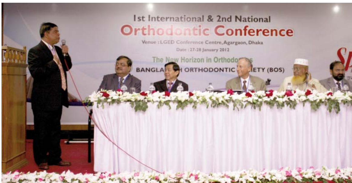
PHOTO OF INAUGURAL SPEECH AT BOS MEETING