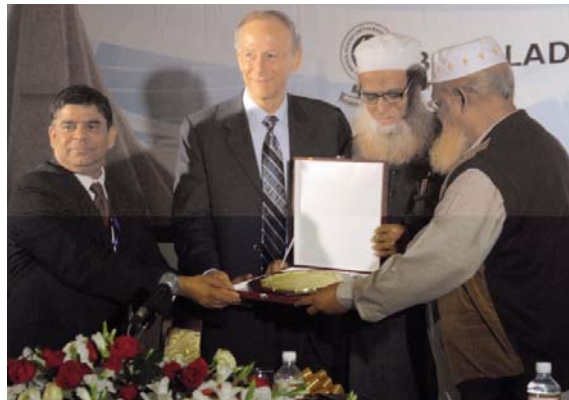
Honorary BOS membership awarded to WFO president