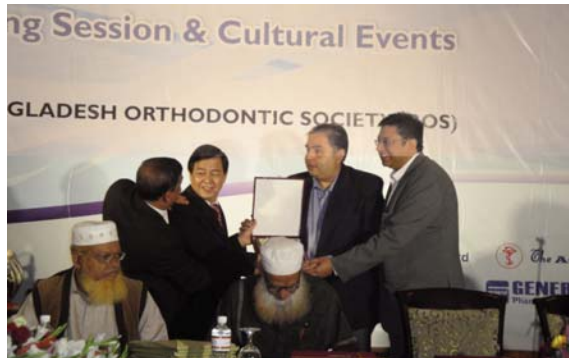
Plaque of appreciation given to APOS publication by BOS