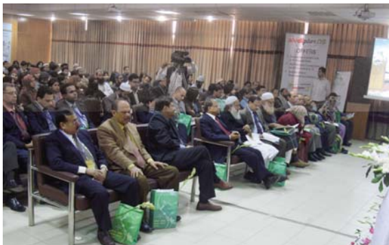
Partial view of Scientific Session