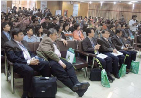
Partial view of a Scientific session