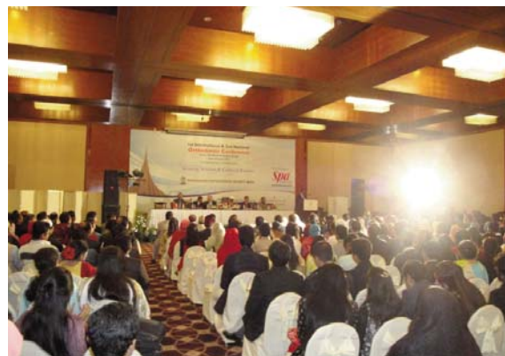
Closing session in PanPacific Sonarga Hotel