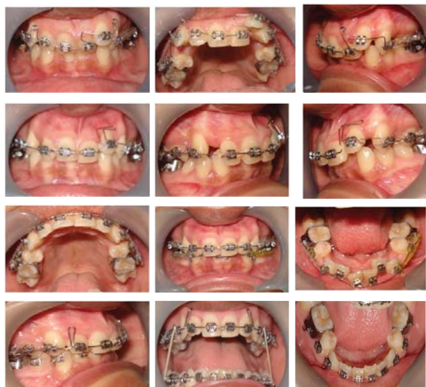
FIGURE 2: During different treatment stages

incisor, so the canines were first distally retracted. The anterior segment was flared simultaneously using multiloop 0.014 stainless steel arch wire containing helical and with an omega loop in front of molars. Canine retraction continued and subsequently 0.014 round stainless steel archwire with “L loop” was introduced to further align the lateral incisor.