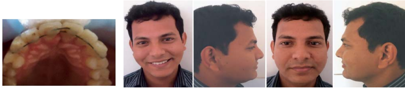
Fig.6: Fixed Retainer