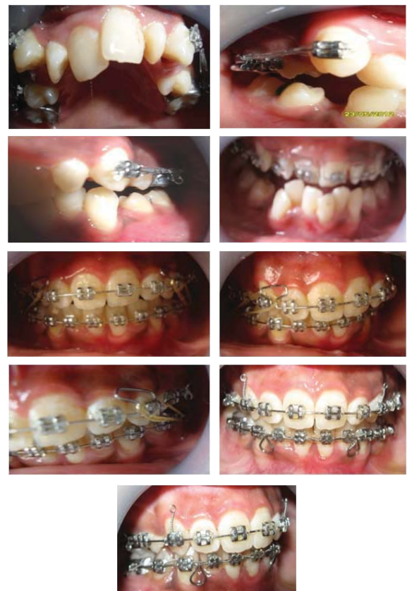
Fig3: Progress intraoral photograph