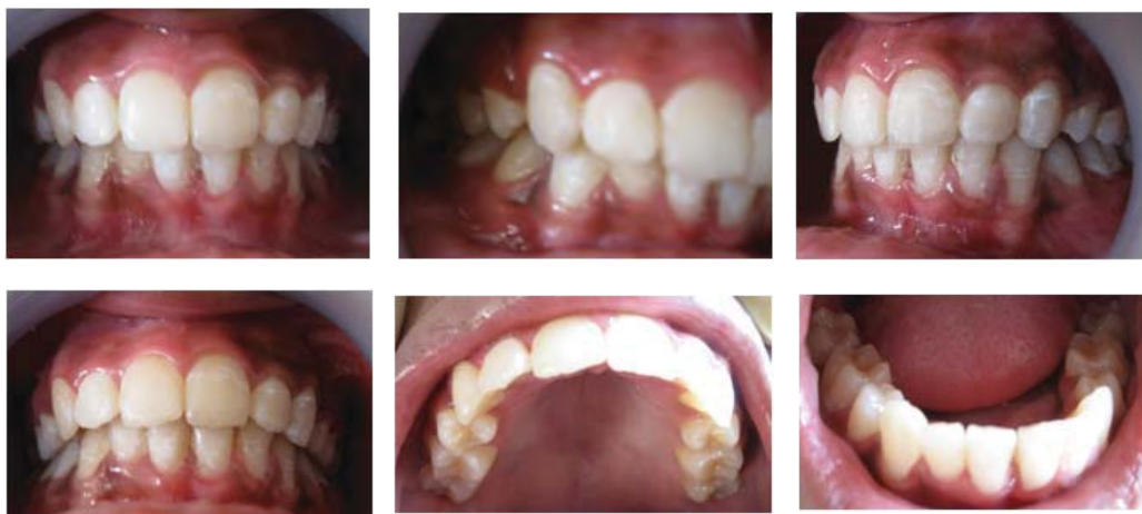
Fig6: Intraoral photograph after treatment