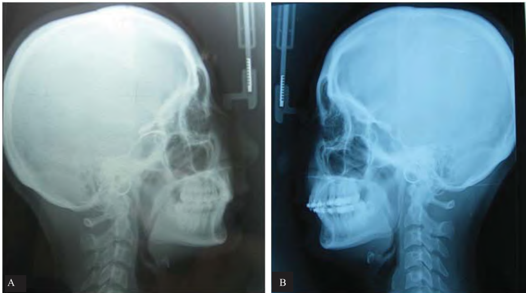
Fig5: Cephalogram before (A) and after treatment (B)