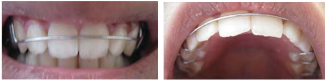
Fig7: With Hawley retainer