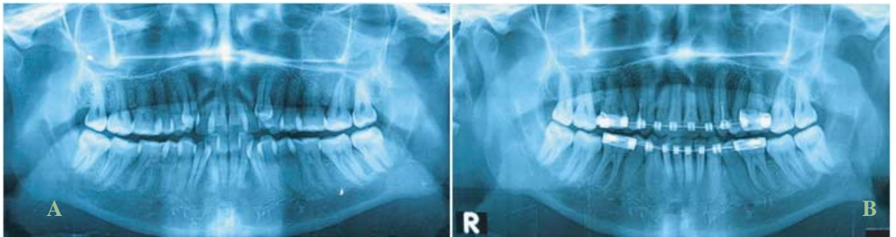
Fig4: Panoramic Radiograph before (A) and after treatment (B)