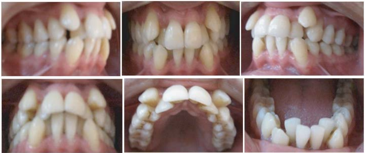
Fig2: Pretreatment intraoral photographs