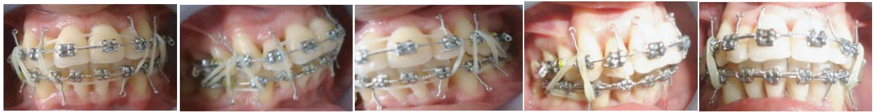
Fig3: Progress intraoral photograph