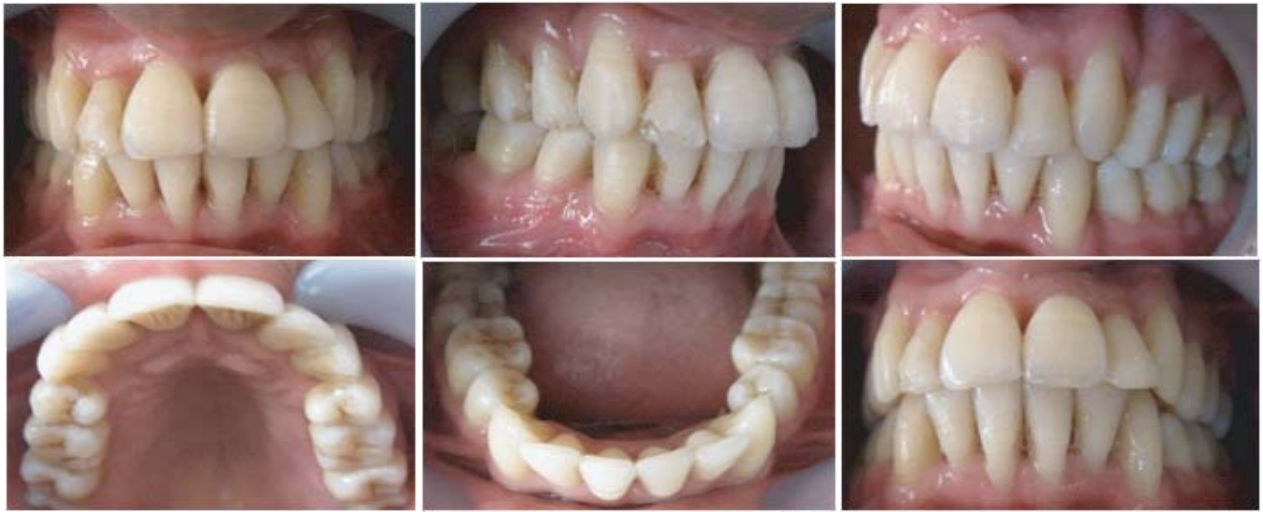
Fig6: Intraoral photograph after treatment