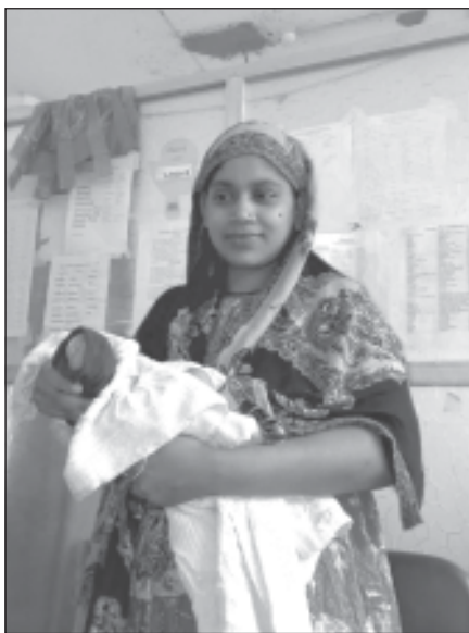
Fig 2: Pt and baby during discharge.