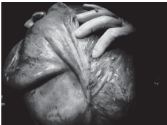
Fig-2: A big myoma separating from fundus of uterus.

After correcting anaemia with 5 bags of packed cell, laparotomy was done. Right paramedian vertical incision was given. Uterus was hugely enlarged tightly occupying whole abdomen, some additional pedunculated fibroids were found to be arising from the fundus and body of the uterus posteriorly. Uterus was adherent posteriorly to the sacrum, occupying whole of the pelvis with restricted mobility. Fallopian tubes and ovaries could not be reached. Vertical incision was given in the uterus and multiple fibroids were removed to reduce the size of uterus. It was so big that even after removal of several fibroids, with two- three myoma screw, uterus could not be mobilized from abdominal cavity. Some myomas were necrotic and foul smelling. Some myomas showed cystic and degenerative changes. Most of