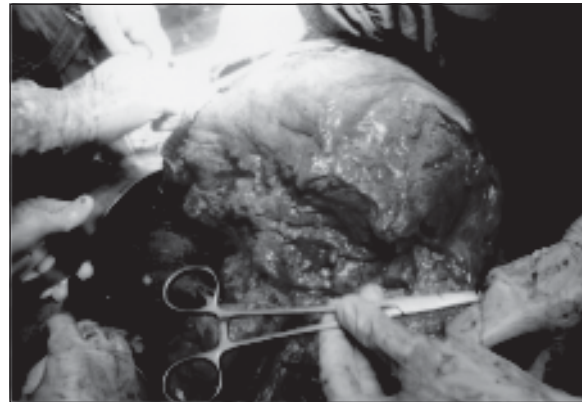
Fig-3: Part of necrotic tumour.

the myomas were intramural and pedunculated. After removal of several myoma fundus of uterus, fallopian tubes and ovaries were visualized. Right ovary was polycystic and diathermy cauterization was done,