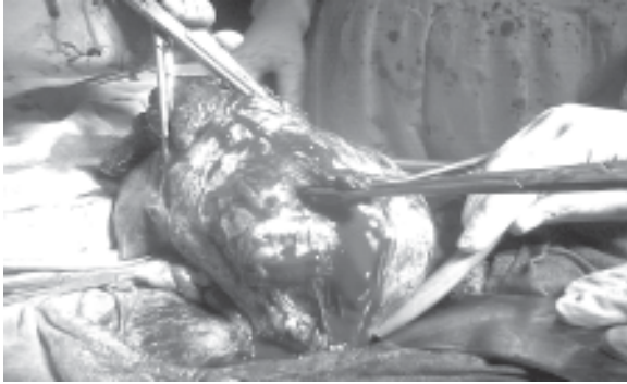
Fig.-1: Per operative picture showing perforating site of uterus by placenta being held with sponge holding forcep

Her pulse was 88 beat/min, Blood pressure was 110/70 mm of Hg. She was mildly anaemic. On per abdominal examination-uterus was non-tender, scar tenderness was absent and fetal heart rate was 142 beat/min, regular. On per vaginal examination: cervix-soft, os-closed, there was no bleeding or discharge. Her investigation revealed –