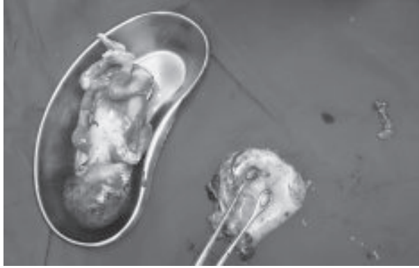
Fig.-2: Excised rudimentary horn with dead fetus.

Rudimentary horn was excised and uterus was repaired. Left salpingectomy was done. Patient was transfused with two units of blood during operation. Her postoperative period was uneventful. She was discharged on 10 th postoperative day.