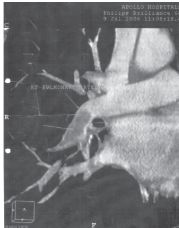
Pulmonary angiogram showing non-enhancing thrombus in the distal right main pulmonary artery and extending to right lower lobar branch with moderate to severe luminal narrowing.