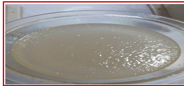
Figure 1: Extracted gel from Plantago ovata husk

Modification of polysaccharide yield structurally and functionally altered derivatives having potential to be explored for their use in different fields. The polysaccharides which have undergone modification include starch (Chen et al., 2007), cellulose (Hon, 1996), chitosan (Rinaudo, 2006), psyllium (Singh and Sharma, 2010) and guar-gum (Dodi et al., 2011). Carboxymethylation of arabinoxylan with sodium monochloroacetate resulted in replacement of -OH group with carboxymethyl group.