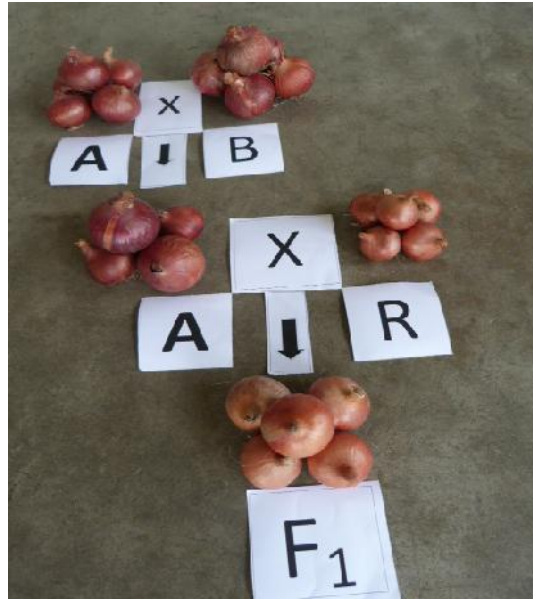
Fig 5. Hybrid variety of onion ( Allium cepa L.) development using CMS mechanism.