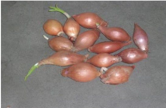
Fig 2. Sprouted bulb of shallot Onion