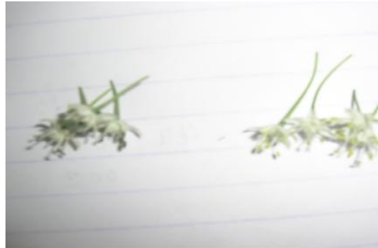
Fig 3. Male sterile flowers (left) and male fertile (right) flowers in umbel of onion