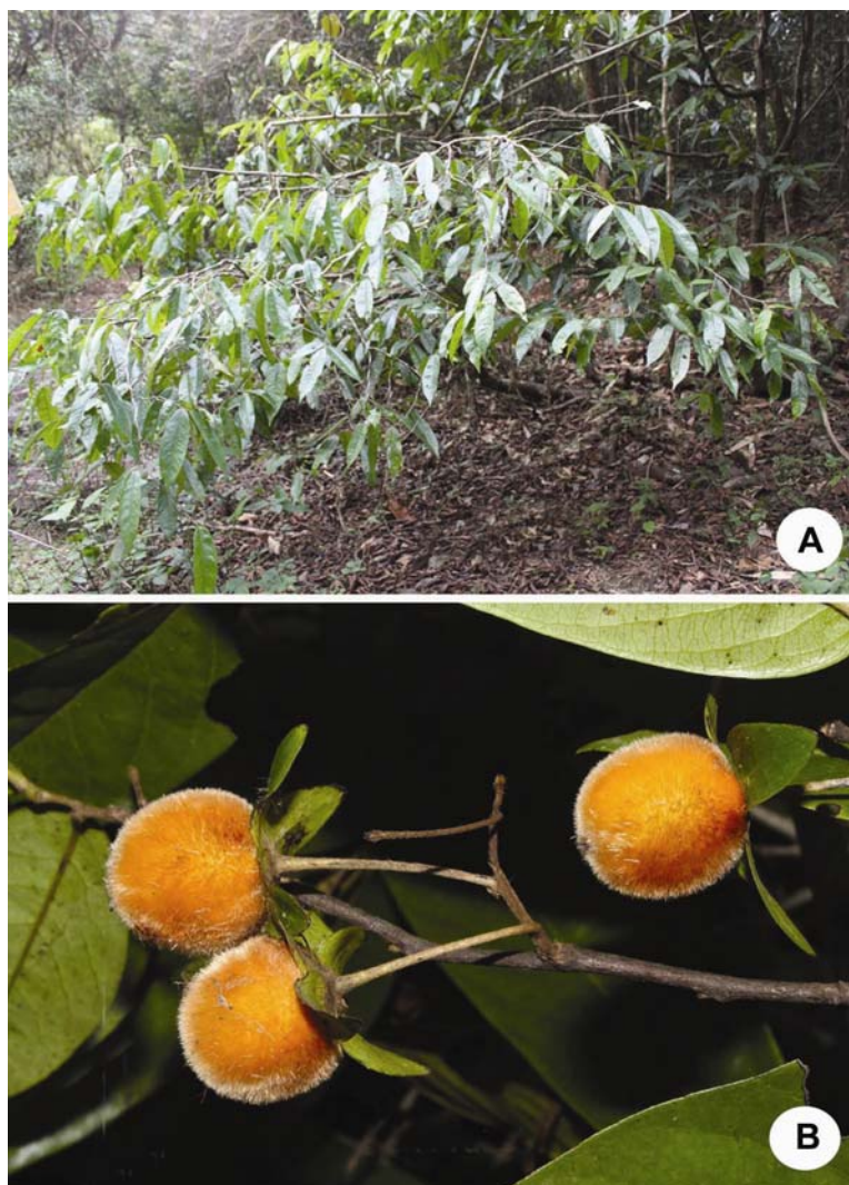
Fig. 1. Diospyros udaiyanii P.S. Udayan, sp. nov. A. Habit; B. Fruits.