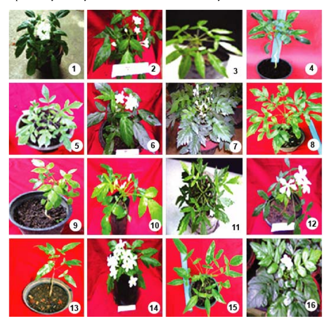
Plate 1. Different morphotypes of Munronia pinnata , available in different locations in Sri Lanka. 1. Dambagalla, 2. Haldummulla, 3. Kalumdewa, 4. Kithulpe, 5. Kuliyapitiya, 6. Madulla, 7. Monaragala, 8. Meemure, 9. Mathurata, 10. Nilgala, 11. Naula, 12. Okadagala, 13. Pallewela, 14. Ritigala, 15. Warakapola, 16. Wellawaya.

However, in eight DSD divisions namely, Attala, Mundalama Matara, Pallepola, Baticalloa, Jaffna, Katana and Negombo, including 60 GN areas, M. pinnata was found neither growing naturally nor as in cultivation. Ten new localities were recorded in present survey and three of them were in the wet zone (Map 1). This plant had been reported only from dry and intermediate zones of the country.