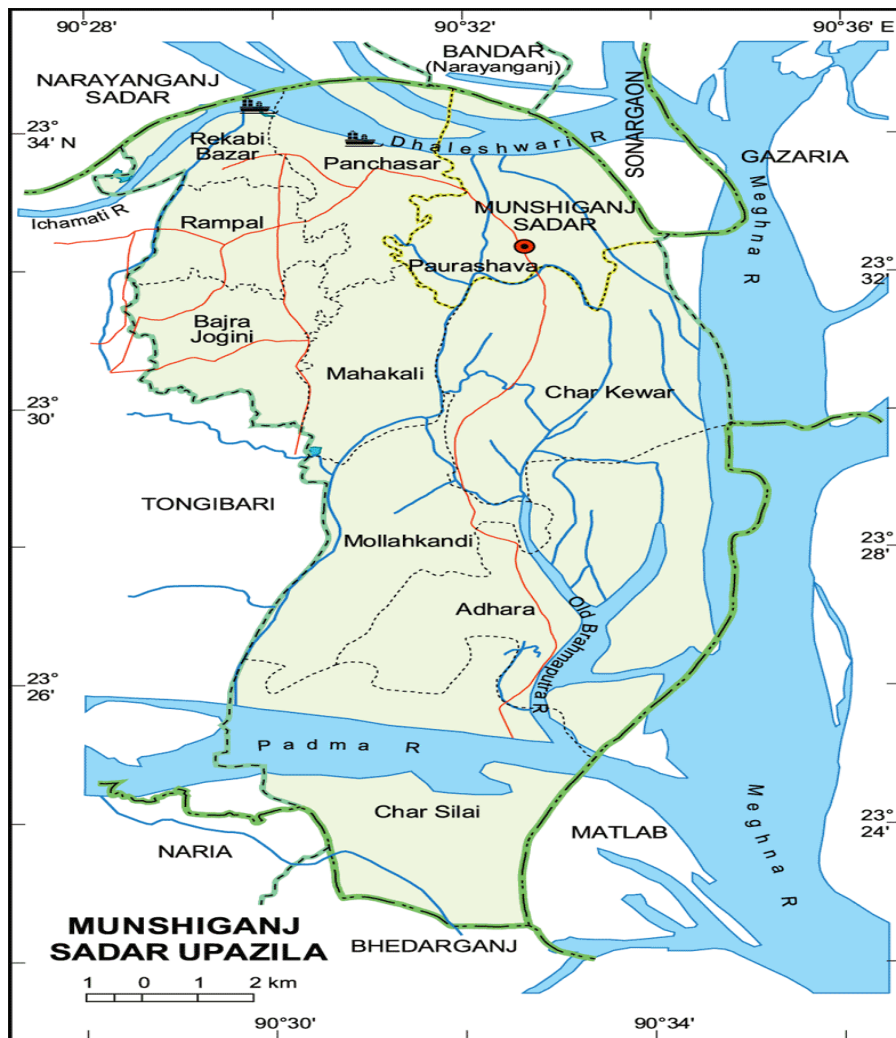
Fig. 1. Map of Munshiganj Sadar Upazila showing the sampling sites of different unions.