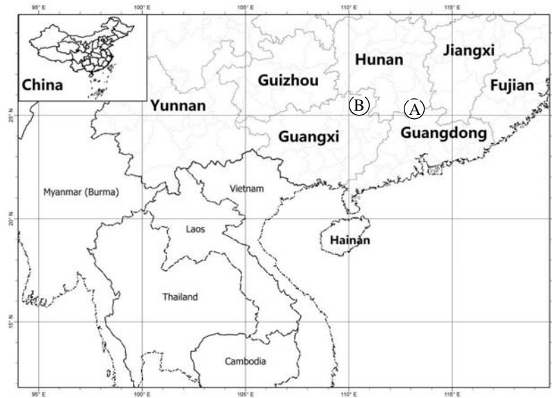
Fig. 3. Distribution of Primulina lechangensis X. Hong, F. Wen & S.B. Zhou, sp. nov. (A) and its related species, P. longicalyx (J.M. Li & Y.Z. Wang) Mich. Möller & A. Weber (B) in China.

Note: Primulina lechangensis is morphologically close to P. longicalyx (J.M. Li & Y.Z. Wang) Mich. Möller & A. Weber based on the shape of leaf and flower, but it can be easily distinguished by some additional characteristics. A detailed comparison of the diagnostic characters between P. lechangensis and P. longicalyx is shown in Table 1.