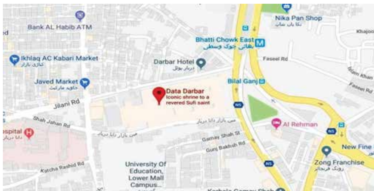
Fig. 1. Location of sampling area

SPM was further fractionated into alkanes, aromatics, nitrogen, oxygen and sulphur containing compounds by column chromatography using silica gel. Alumina was used to fractionate aromatic by column chromatography (Kalim et al. , 2016). One-way analysis of variance (ANOVA) was applied by using SPSS 17.0 (IBM SPSS Statistics 19).