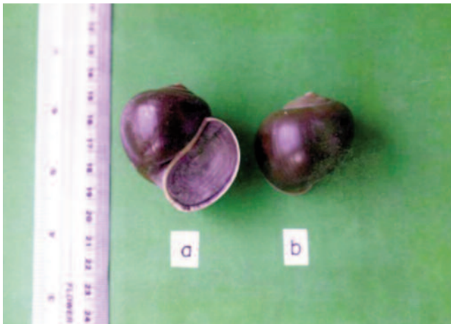
Fig. 2. Apertural (a) and abapertural (b) views of Pila globosa .

was performed completely with the total waterloss of the habitats. Saxena (1956) observed P. globosa to occur usually near the banks of the lakes and sometimes encountered a few snails in the deeper waters during aestivation period. A study by Raut (1984) was made to observe the distribution of P. globosa which suggests that this amphibious prosobranch usually occurred in large numbers in the paddy fields during monsoon and in the ponds throughout the year.