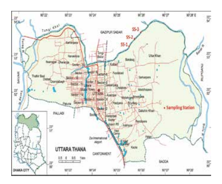
Fig. 1. Untreated effluent discharged into the Turag river

originated from the Bangshi river in Kaliakair Upozila. Truag river is a commercially important and navigable river all year round. According to literature, the Turag is facing huge pollution problem from industrial and household sources. Therefore, we select this river as our study area in industrial vicinity. Samples were collected from the three preselected untreated industrial effluent discharged arena of the Turag river (Fig. 1) during Dry (February) and Wet (June) season in 2015. The sampling stations were Dhaka dyeing (SS-1), Hossain dyeing (SS-2) and Zaber & Zubair Fabrics (SS-3).