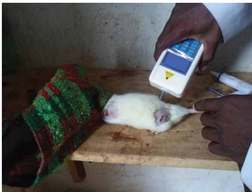
Fig. 2. Evaluation of pain perception in rats using an algometer

Incisional wound model was adopted. Four albino rats consisting of 2 males and 2 females of 24 weeks old weighing about 200 \pm 20 g were used. They were housed separately in a steel cage and fed with commercial rat feed (prepared from Vital Feed® grower mash) and water ad libitum . The research was conducted based on the ethical guideline and rules by the Ahmadu Bello University Committee on Animal Use and Care. The approval number given was ABUCAUC/2016/027. The animals were allowed to acclimatize for 2 weeks before the experiment. Each rat was anesthetized by intra muscular injection of Rompun (R) (xylazine hydrochloride) and ketamine hydrochloride at the dosage of 5 mg/kg and 40 mg/kg respectively. One centimeter full thickness skin incision was created on 4 different locations at the dorsal region of each rat under anaesthesia. Each of the 4 wounds created (E, F, C, and G) was topically treated once daily with S. longiflora sap, S. longiflora aqueous extract, Physiological saline solution (PSS) and Xylocaine cream respectively. The xylocaine cream consists of Lidocaine hydrochloride Gel B.P which was produced by Alves Healthcare Pvt. Ltd. Nangal Uperia, Swarghat Road, Road, India (Mfg. Lic No. HP/DRUGS/MB/07/676). The treatment regimen was rotated in a clockwise direction on each rat.