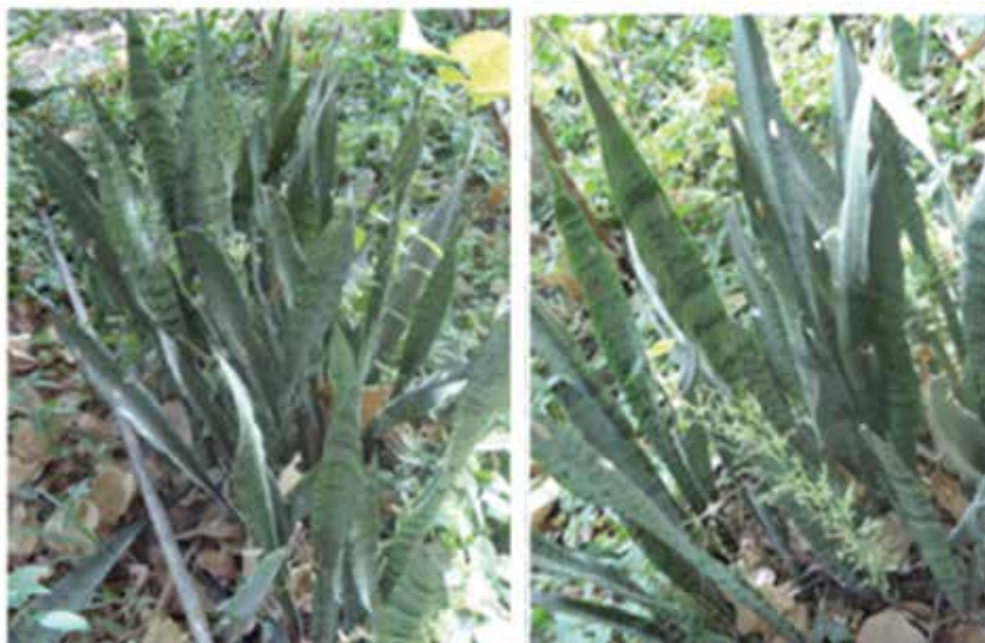
Fig. 1. Sansevieria longiflora (Sim)

Sansevieria longiflora (Figure 1) is commonly referred to as Florida bowstring hemp, mother-in-law tongue, bowstring hemp. It is also known in Nigeria as Oja ikooko (Yoruba) or Moda (Hausa). Though it is commonly used as ornamental plants in offices along with Sansevieria liberica in various parts of the country, it is as well known for its medicinal purposes. In the North-Eastern and South-Western part of Nigeria, the leaf of S. longiflora is popularly used as ligature. It is strapped round a very deep cut from the cutlass, sickles or other sharp objects while working on the farm. Subsequently, the leaf is heated so as to be able to squeeze out the sap into the wounds. This is traditionally used to manage deep wounds and chronic wounds that failed to heal. The root decoction is also used to treat whooping cough and diabetes in human.