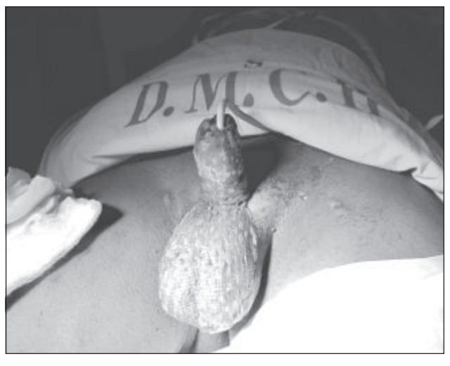
Fig.-5: Removal of dressing on 5<sup>th</sup> post operative day

removed on 5<sup>th</sup> postoperative day. Post operative micturition and erectile function was normal.