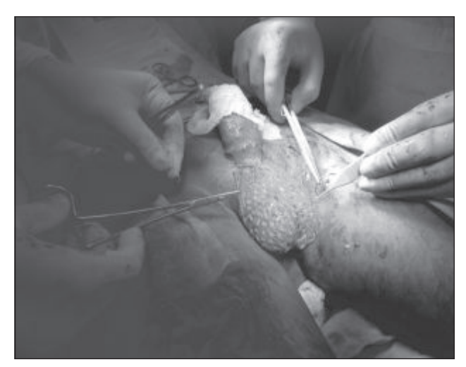
Fig.-3: Penile shaft covered with split thickness skin graft with anterior scrotum.