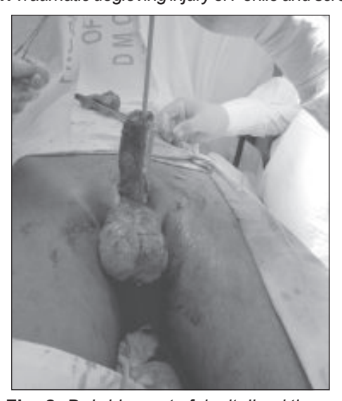
Fig.-2: Debridement of devitalized tissues.