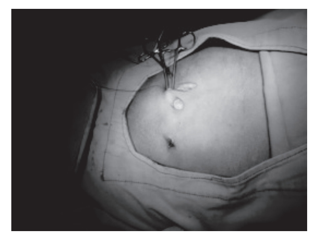
Fig.-2: Steps of catheter insertion