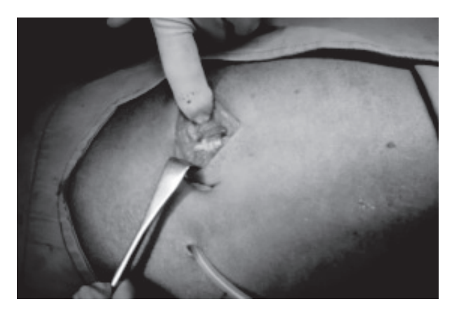
Fig.-3: Steps of catheter insertion