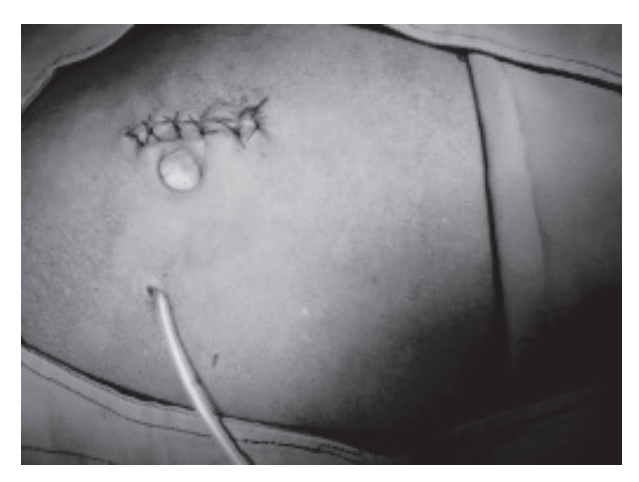
Fig.-4: Steps of catheter insertion