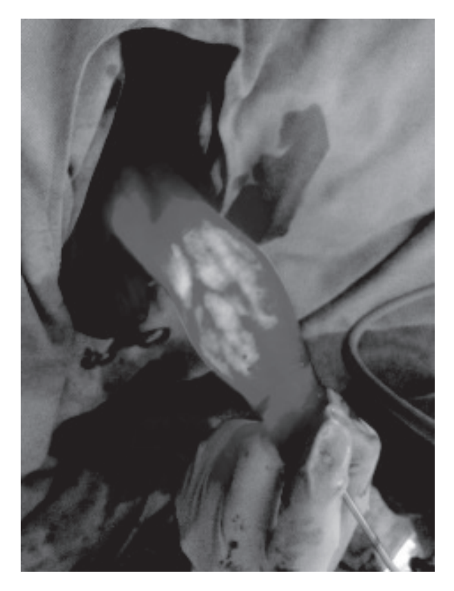
Fig.-3: Urethrocystoscopy showed whole of the anterior urethra was very thin walled with transmitting lights through it.

external sphincter was grossly narrowed through which cystoscope could not be negotiated. Urethrocystoscope was then introduced through the abnormal urethral opening into the perineum. This urethral opening was located in the midline raphe of the perineal region about 2 cm from the anal verge. Urethral lining seemed like well developed urothelium. About 5 cm proximal to this opening, this urethra joined with the penile urethra distal to the external sphincter. Prostatic part of the common urethral channel was normal containing verrumontanum and a normal bladder neck. Both the ureteric orifices were normally placed in the trigone. Bladder mucosa was normal except a small diverticulum arising from the left lateral wall of the urinary bladder.