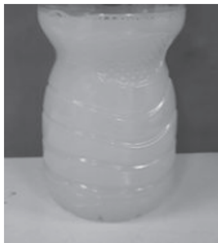
Fig.-3: Pre-procedure urine sample