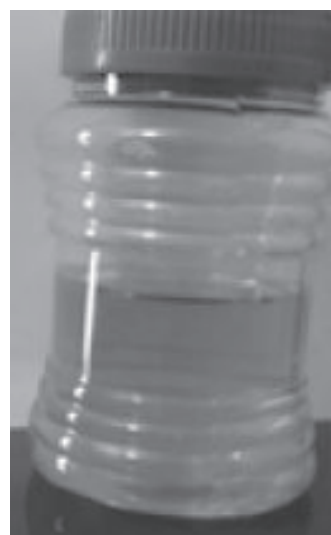
Fig.-4: Urine sample 2 weeks after sclerotherapy