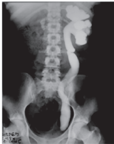
Figure 1: IVU showing left sided primary obstructed megaureter in 10yrs old child (personal series)

In our study total patient was 35. Male patient were 20 (57%) and female 15 (43%). Age range was 2 years to 19 years. Six patients were asymptomatic and was diagnosed incidentally. Other presenting complaints were; loin pain (10= 28%), recurrent UTI (26= 74%), abdominal mass (1= 3%), haematuria (2=6%) and impaired renal function (2=6%).