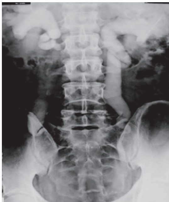
Figure 2: IVU showing bilateral POM (personal series)

Table 1 showing comparison of pre and post-operative split function and GFR between two age groups and two operative approaches on the affected right kidney (n= 17). Observation showed bulk of the patients were on 2-10 years (n=15) and most of them were underwent extravesical ureteric reimplantation (n= 12). Their postoperative split function and GFR showed statistically significant improvement.