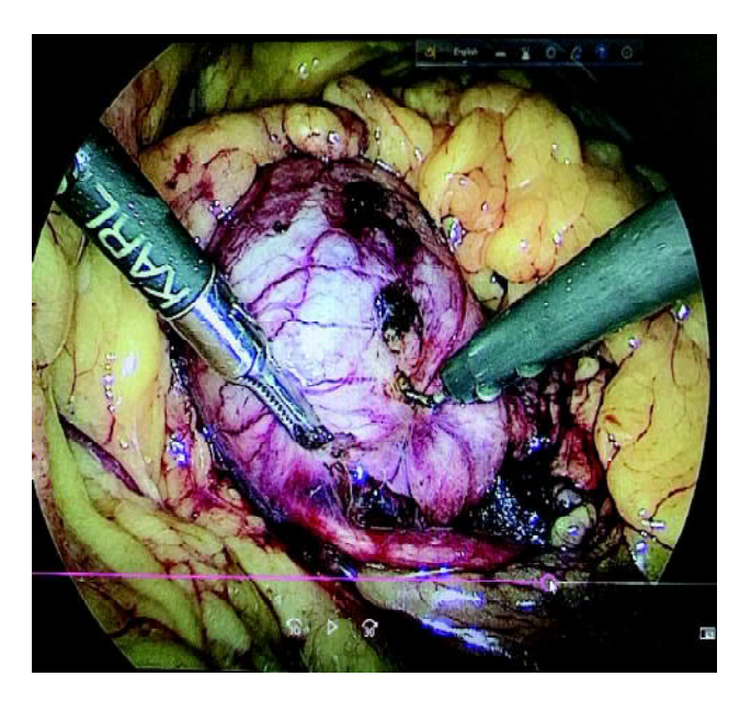
Fig.-2: laparoscopic view ofdilated renal pelvis and ureter

removed when the suctioned material fell to less than 10 ml. A Foley catheter was put in place, usually for 96 hours. The double J stent was removed after 6 weeks.