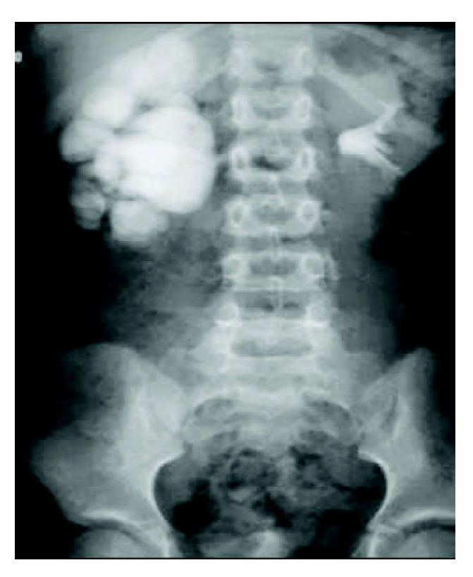
Fig.-1: IVU showing UPJ obstruction