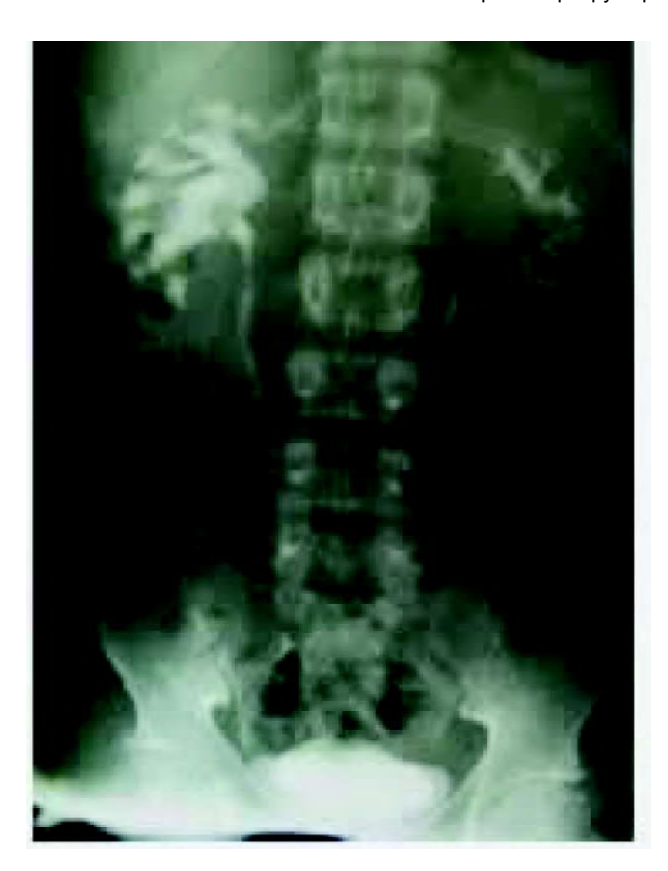
Fig.-4: Postoperative IVU showing patent UPJ