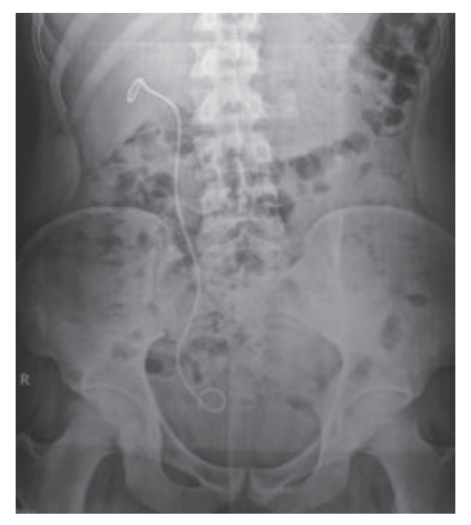
Fig.-2 : Post laserlithotripsy plain X-ray KUB showing only Rt Dj stent but no radio-opaque shadow /stone