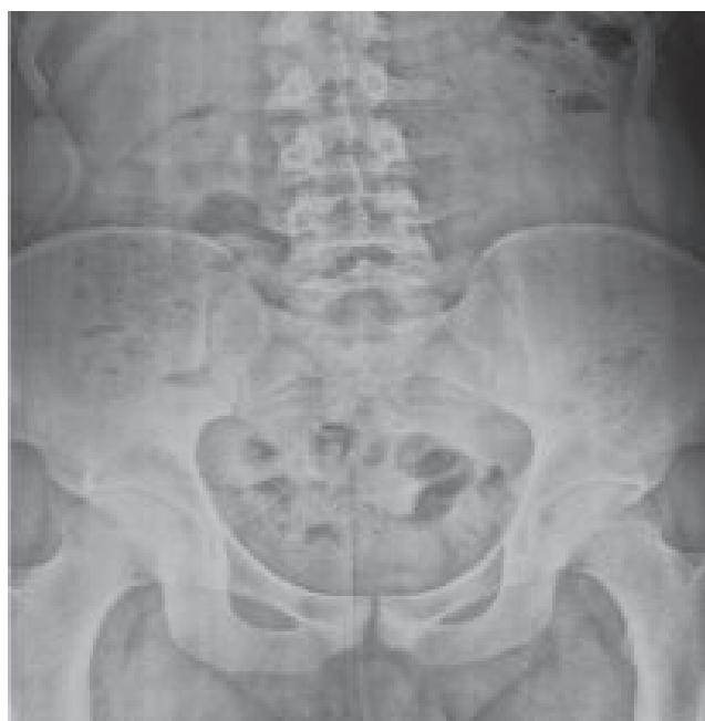
Fig.-1: Pre-operative film shows about 10 mm stone at proximal ureter