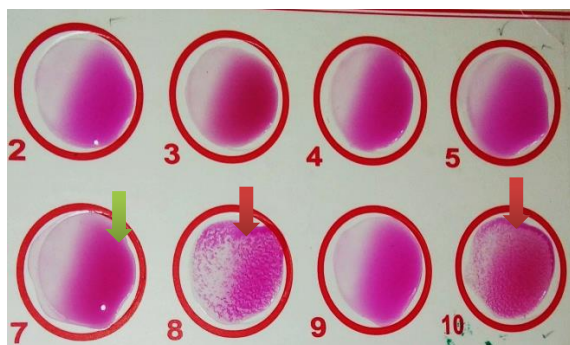
Figure 4. Rose Bangal Test (RBT). Arrows are indicating the positive cases.