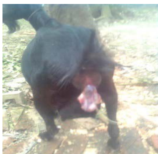
Figure 1. Retention of placenta in a goat

The data was recorded on excel and were analysed by using SPSS software version 20 (SPSS, Inc., Chicago, IL, USA).