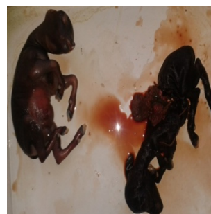
Figure 3. Aborted fetus in a goats