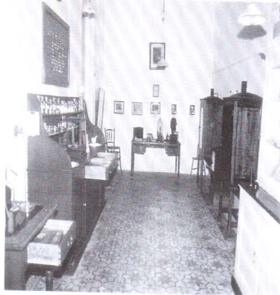
Fig. 3. Restored laboratory of Bruce and others in Malta (courtesy by E. Young, 1995).