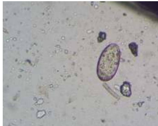
Figure 4. Ova of Paramphistomum sp.

Similarly, Mamun et al. (2011) reported highest prevalence of endoparasite in young buffaloes (>2-5 years) than adult in Kurigram district of Bangladesh and Asif et al. (2007) also reported the higher prevalence of helminth in young than adult in Pakistan. The awareness program on calf mortality due to ascariasis was done through deworming campaign by veterinarian and paravet staff in the study area may be the cause of lower prevalence at young ages.