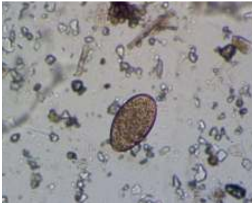
Figure 3. Ova of Fasciola sp.