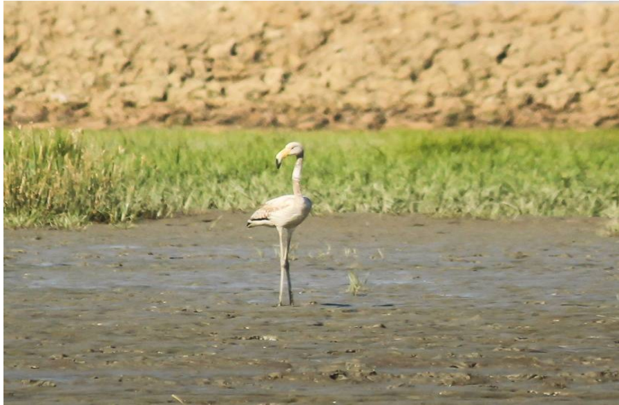
Fig. 2. Phoenicopterus roseus in its natural habitat at Kohelia Channel, Matarbari, Moheshkhali, Chittagong

just over three hundred meters. Kohelia Channel of Matarbari is one of the very important ground for many wildlife species. Previous surveys of the Moheshkhali Channel found 79 species of fish, including 78 bony fish species. The site is very rich in mollusks and crustaceans. Crustaceans include various species of portunid crab, Mud Crab and Blue Swimmer Crab. Of particular importance is