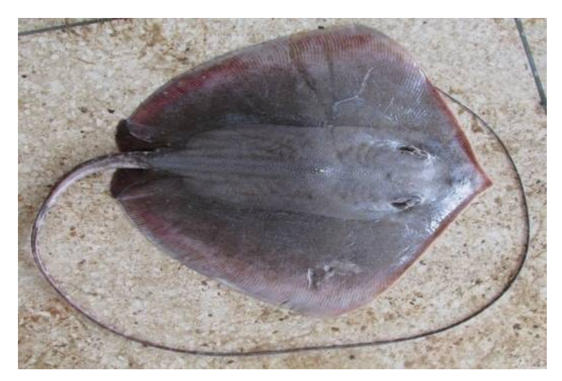
Fig. 4. Dasyatis bennettii (Müller and Henle 1841), © M. M. Hossain.

Recorded disc width (DW) is 50 cm and total length 130cm approximately but the species reaches a maximum total length (TL) at least 275 cm male (Lafrance 1994). Snout tip of Hemitrygon bennetti (Müller and Henle 1841) with rhomboid disc triangular and moderately protruding. Species color is yellowish brown upside, becoming darker on the tail fold, and below is lightly. Pectoral fin disk like diamond-shaped, tail is whip-like, stinging spine present on the upper surface of the tail, dermal denticles present in the middle of the back side. Tail length about three times disc length; disc and snout longer; head length about half of disc wide. Small bony fishes and crustaceans used as food (Thollot 1996).