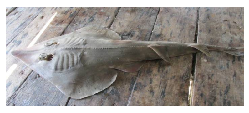
Fig. 3: Rhinobatos annandalei (Norman 1926)

Recorded total length is 55 cm approximately. Snout elongate, anteriorly flattened, Stout tail, confluent with trunk. Pectoral fins expanded, attached to the head from nostrils to ½ the snout length. Dorsal fins relatively large, pelvic fins single lobed, caudal fin not bilobed, mouth is short and relatively straight, teeth is small molariform, Spiracles well developed. It is ovoviviparous (Dulvy and Reynolds 1997).