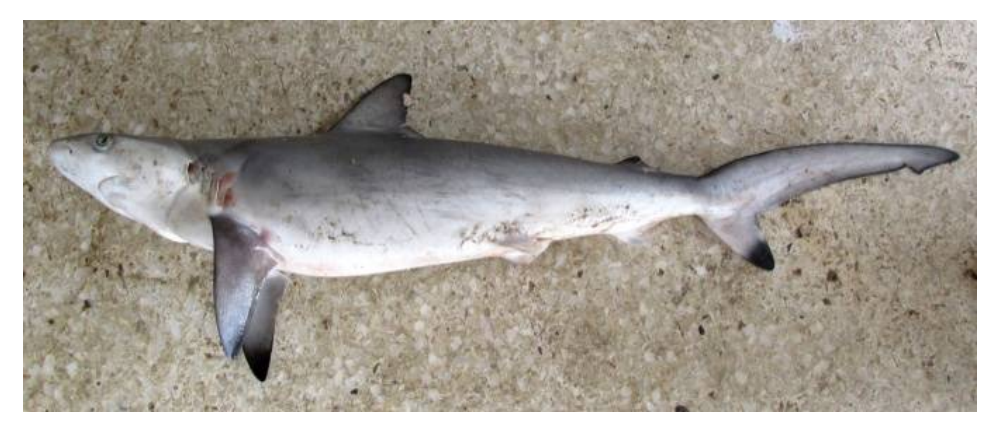
Fig. 2. Carcharhinus limbatus (Müller and Henle 1839).

abundantly caught species in Bimini, Bahamas (Kessel 2010). This shark is a target species as commercial shark fishery in the United States and the Gulf of Mexico (Branstetter and Burgess 1997).