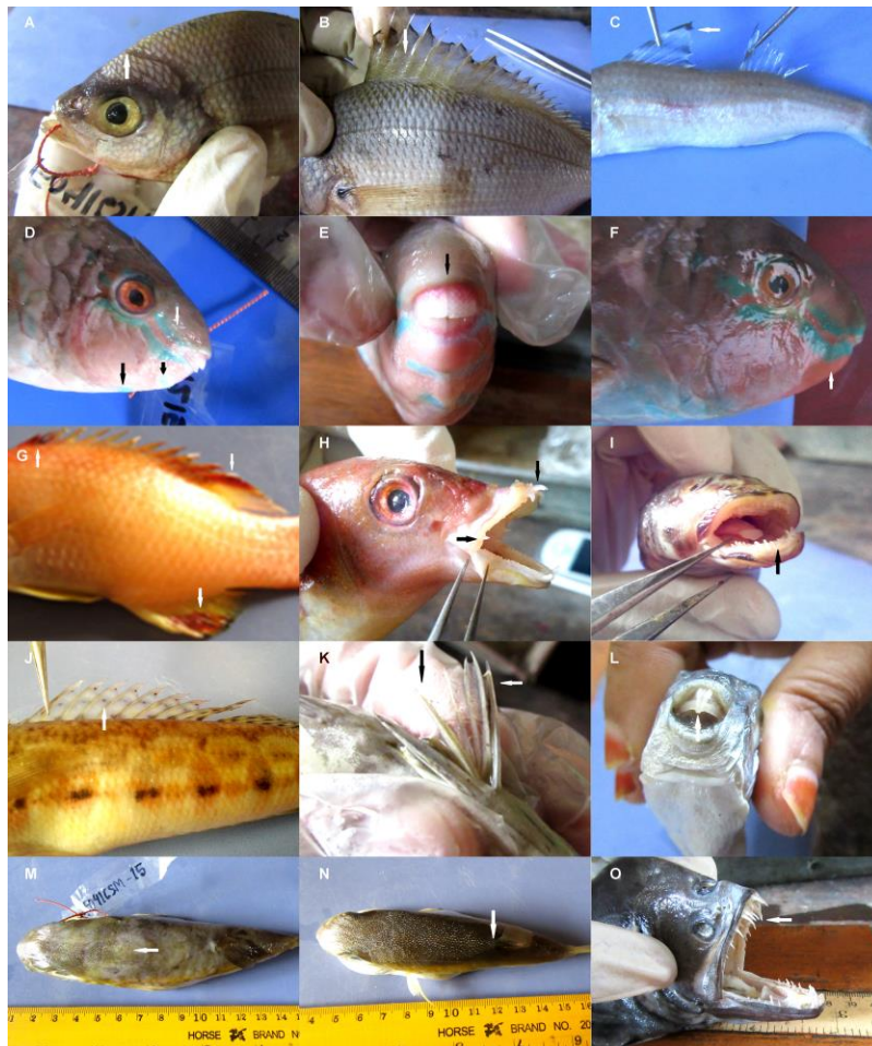
Fig. 3. Identification of the morphological characteristics of the newly recorded coral-associated fish species. (A) Continuous supratemporal band of scales in C. cuning , (B) Scales cover half of the dorsal fin height in C. cuning , (C) Blacktip in D1 of U. suahelicus , (D) Two blue-green stripes on the head above and below the eye and two blue-green bands on the chin of S. taeniopterus , (E) Teeth fused into a beak-like plate in S. taeniopterus , (F) Orange chin of S. zufar , (G) Two red patches on the dorsal fin and a red patch with a small black spot in the middle of the anal fin in B. neilli , (H) Anterior canines and posterior canine in B. neilli , (I) Recurved canine in P. clathrata , (J) Black spot on the dorsal fin of P. clathrata , (K) The pelvic fin of S. fuscescens with II spines (one inner and one strong outer spine, with three soft rays in between), (L) Beak-like teeth in L. spadiceus , (M) A patch of spinules on the back between the snout and halfway to the dorsal fin origin in L. spadiceus , (N) A patch of spinules on the back from behind the nostril to the dorsal-fin origin in Lagocephalus lunaris , (O) Large canine teeth in P. bennettii

Holotype : F0216SM25, female, 8.5 cm standard length; collected on February 17, 2016.