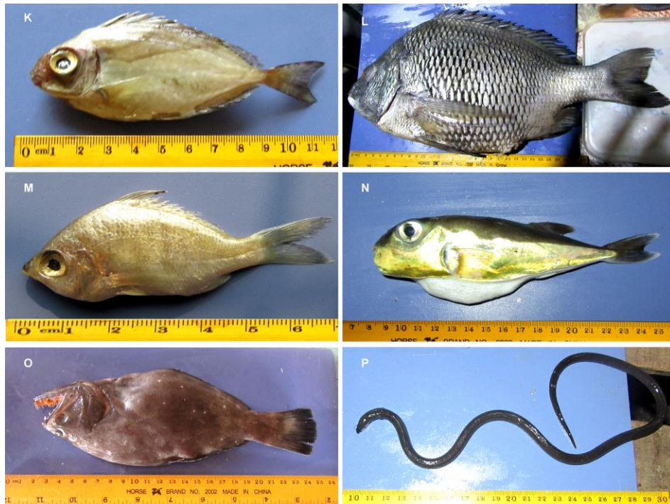
Fig. 2. Seventeen newly recorded fish species from the coral ecosystem of St. Martin's Island, Bay of Bengal, Bangladesh. (A) C. cuning (12.8 cm SL), (B) L. ornatus , (8.60 cm SL) (C) U. suahelicus (7.00 cm SL), (D) U. asymmetricus (8.50 cm SL), (E) S. taeniopterus (16.2 cm SL), (F) S. zufar (29.0 cm SL), (G) B. neilli (12.1 cm SL), (H) P. clathrata (12.5 cm SL), (I) P. diplospilus (4.50 cm SL), (J) P. furcatus (18.7 cm SL), (K) S. fuscescens (9.80 cm SL), (L) A. berda , (M) Gerres erythrourus (5.00 cm SL), (N) L. spadiceus (13.0 cm SL), (O) P. bennettii (19.5 cm SL), and (P) H. perissodon (41.0 cm SL).

The inner surface of the pectoral fin base is scaled. It has six longitudinal scale rows (including small scale beneath the dorsal fin base) between the lateral line onward. The large anal fin has spines in front, the forked and heterocercal caudal fin with a slightly larger upper lobe.