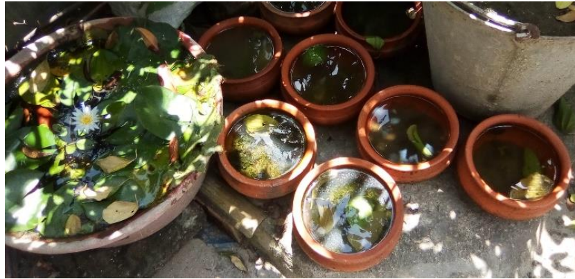
Fig. 3. Earthen pots on rooftop gardening with immature Ae. Aegypti

Key containers: Mainly four types of container namely, cemented tank or water reservoir, drum, big earthen pot (chari) and buckets singly or together with other three types of containers contained about 80 percent of immature Aedes . Therefore, they are potential breeding containers or key containers in the present study areas. But among these four types of container, cemented tank and drum produced the highest number of individuals ( t=1.326 , P=0.277 ). Other containers singly harbored significantly lower numbers of immature (Table 4), but they were numerous than the first two kinds of containers. All containers in different study sites contained heterogeneous stages of immature Aedes that suggested these sites are continuous breeding sites of the dengue vector mosquitoes (Table 3). Among the key containers, the earthen pots were used for rooftop gardening (Fig. 3) and cemented tanks were found mainly in under construction houses as well as rooftop fish culture. Both of the places were prolific vector breeding place due to the inattentiveness of household owners and construction authority.