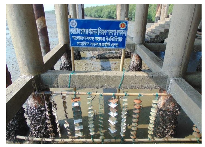
Fig. 2. Installation of clutch materials in the study locations.

study locations. To determine the influence of factors such as collector's type and study locations, Two-way analysis of variance and Duncan multiple range test (P < 0.05) were performed. Finally, the correlation between the density of spats at each of the collectors and water quality parameters were evaluated by Pearson correlation matrix in package ggplot2 in R statistical program. All the analyses were performed in Statistical Package for Social Science (SPSS) version. 20.