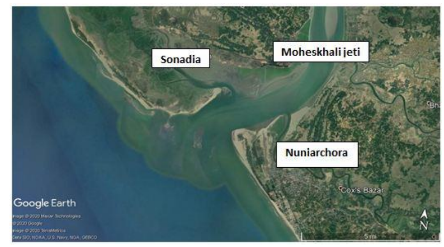
Fig.1 Locations of the study area.

The study was conducted for a period of 7 months from June to December 2019. Three potential locations (Fig. 1) were selected by pre survey at the Moheshkhali, Jeti of Nuniarchora, and Sonadia of Cox's Bazar coast of Bangladesh.